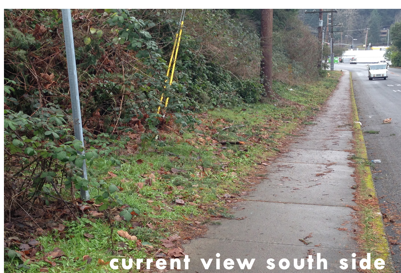
current view south side