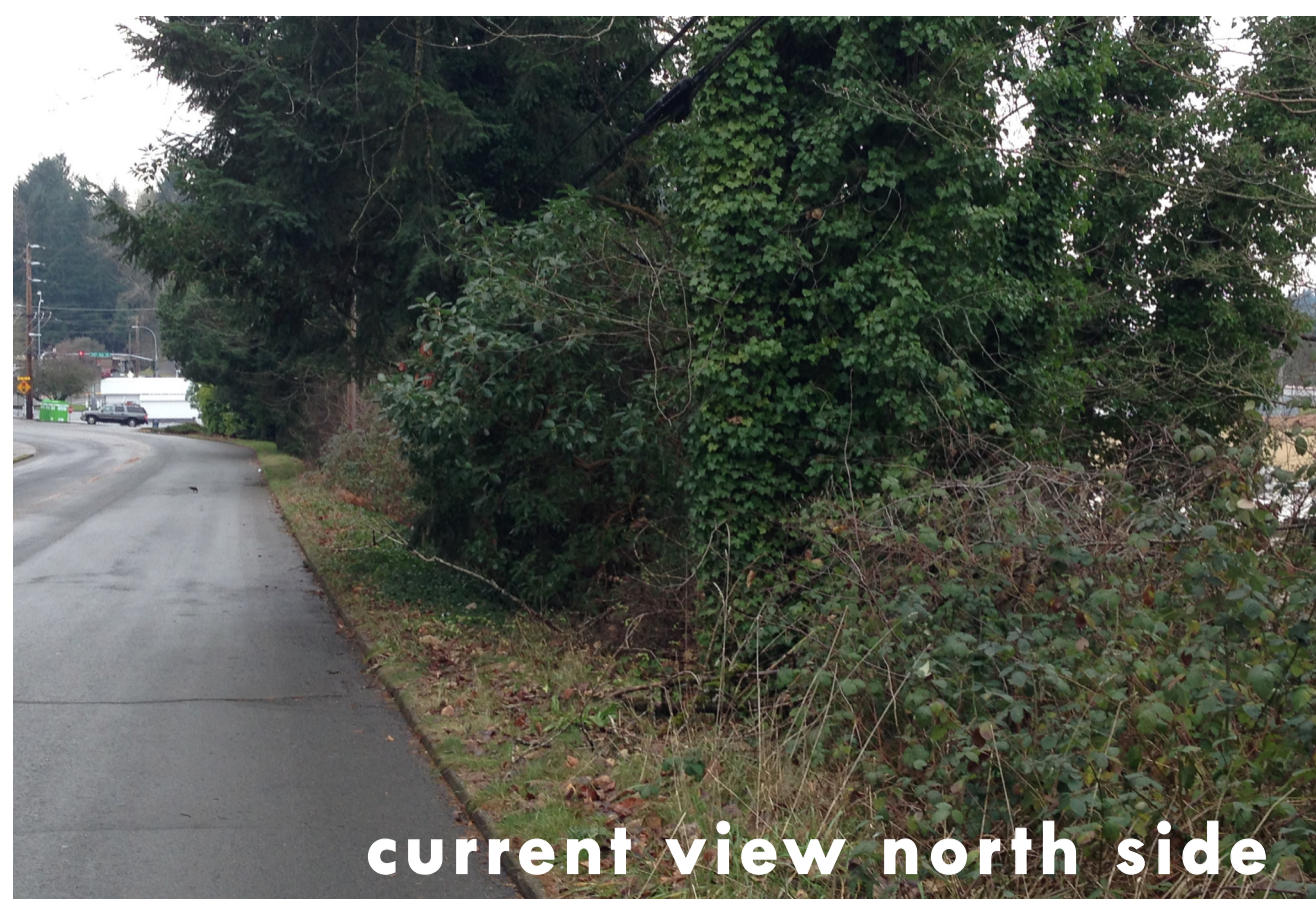
current view north side